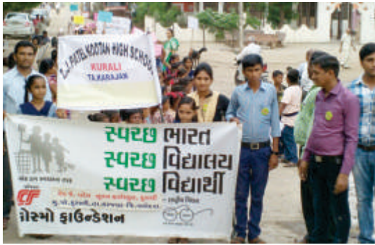
Students spreading the message of Clean India at Kurali village