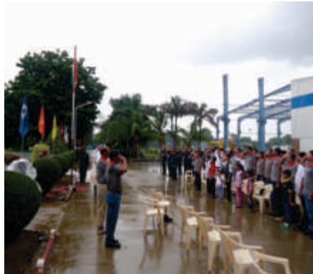
Employees saluting the National Flag at Karjan plant