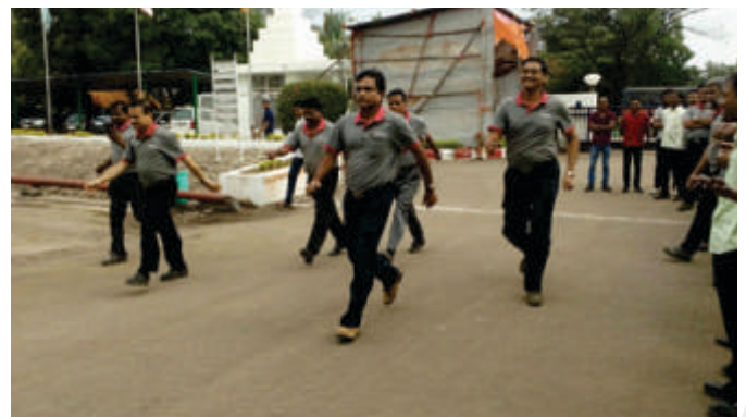
Employees in full swing for fast walk competition