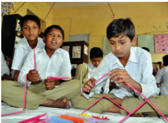
Students busy with props