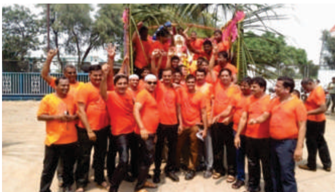
Employees at the Visarjan of Lord Ganesha

Objective – Our factories celebrate this festival for 10 days by organizing different sports like inter-department cricket tournament and fun games like antakshari, lemon race, fast walk, tug of war etc. The objective is to break monotony & give employees a chance to participate in sports & other outdoor activities.