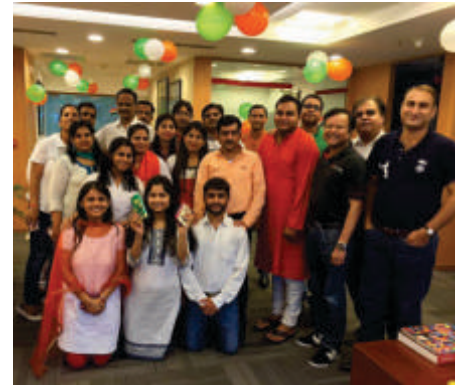
Employees posing after quiz competition held at Delhi office on the occasion of Independence Day celebration