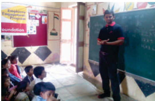
Cosmo Films representative taking a session

The Gujarat Innovative Council, Vadodara had organized Tod, Fod, Jod workshop on 21st August, 2016 wherein three teachers from Cosmo Foundation (CF) participated. It involved interesting activities where participants had to open fan, cycle, key board, desk top, water tap, food mixture, split ACs etc. and other non-functional gadgets and manufacture some utility items out of it. The workshop gave an opportunity to the teachers to think out of the box and apply innovation in teaching.